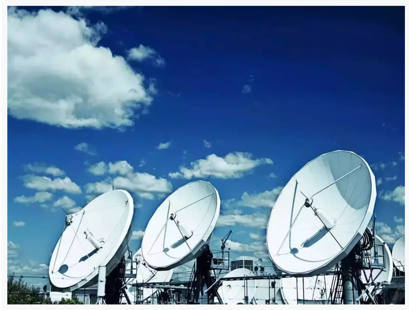
New Delhi: The Department of Telecommunications (DoT) is expected to approach Trai this month to seek the regulator's views on method and pricing for allocation of spectrum and scope of licences to be issued for satcom services, according to sources. The Telecom Regulatory Authority of India (Trai) had floated a consultation paper on "Assignment of Spectrum for Space-based Communication Services" on April 6, 2023 but returned the reference back to DoT after announcement of new Telecommunication Act.

The minister was speaking at a seminar by Women Journalist Welfare Trust. "There is a very risky side, which is affecting our society, democracy, and many of the social structures that were meticulously built over decades and centuries. Many of the institutions that were meant to protect society and make sure that we all live in a harmonious way are under attack," he said.